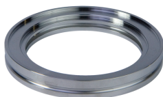
Welded flange ring, stainless steel 304/1.4301, DN 320 ISO-K