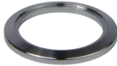
Welded flange ring, stainless steel 304/1.4301, DN 25 ISO-KF