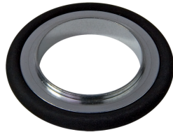
Reducer centering ring, aluminum, FKM, DN 16 ISO-KF